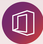
Office 365 iBoT