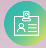
ID Management iBoT