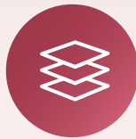
Sugar CRM iBoT