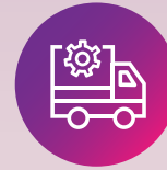
Supply Chain iBoT