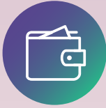
Accounts Payable iBoT