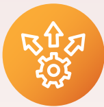
SFDC CRM iBoT