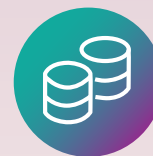
Data Clearance iBoT