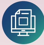
Data Entry iBoT