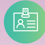
ID Management iBoT